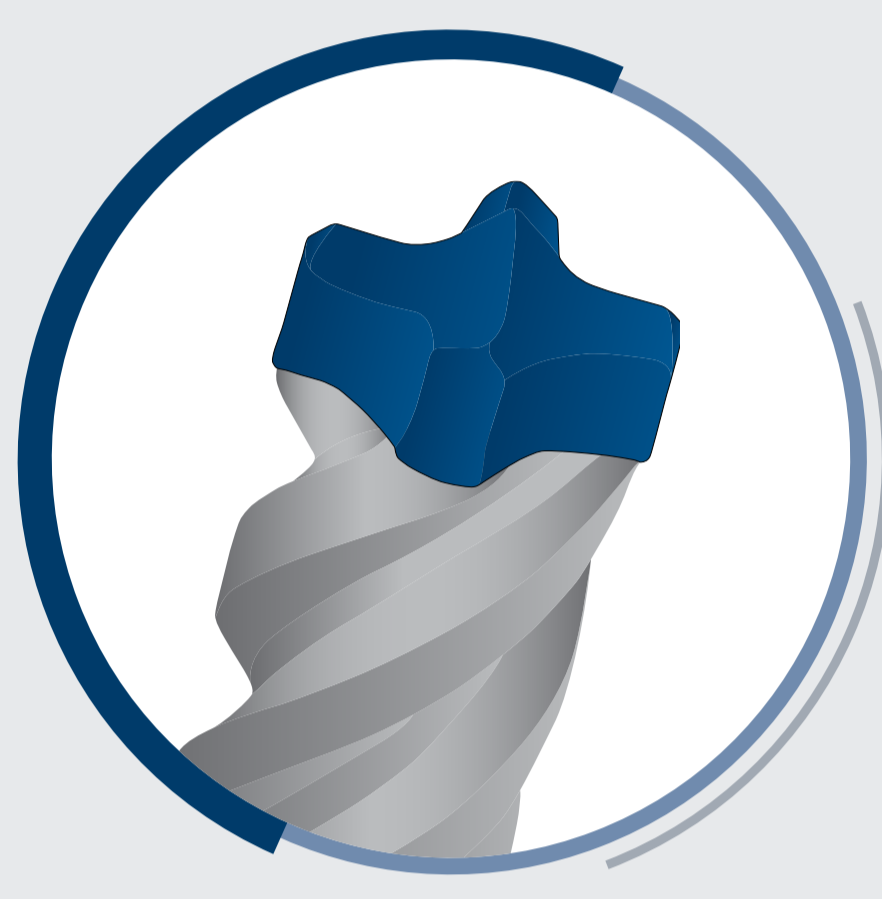
Full Carbide Head